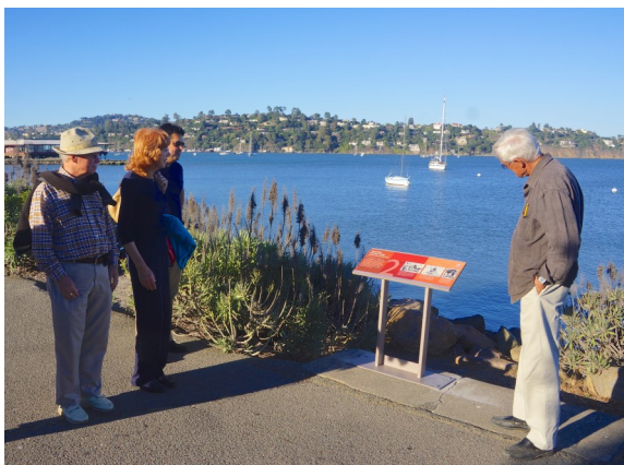
Panels like this will feature Sausalito's early trains and ferries.

The panels that were installed along the waterfront for the Society's 2013 Sausalito Sets Sail project will be replaced in late April by new panels, highlighting the early days of railroads and ferryboats. Stop by the Ice House for more information, and to start this informative walking tour.