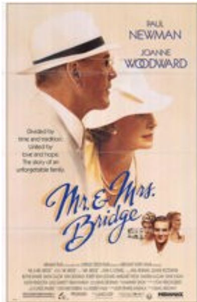
Poster for the movie made from Connell's two most famous novels.