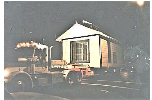
The Ice House moving to its new home downtown