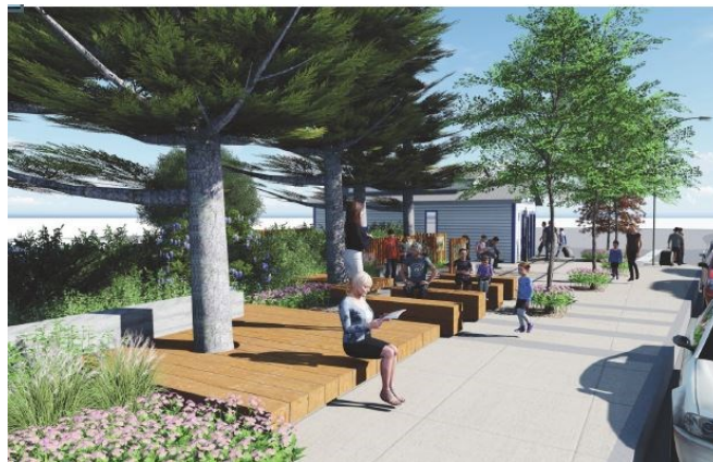
Sausalito landscape architecture firm SWA's rendering of the new Plaza

The Ice House Plaza will serve multiple purposes: a place for the public to linger while enjoying the downtown historic district; an outdoor classroom for the Historical Society's acclaimed local history curricula for Sausalito Marin City School District third grade students; and a venue for docent talks. Native plants will create a "learning landscape" for the 3rd graders to study plants used by the Miwoks and also for home gardeners to learn about attractive, drought-tolerant plants suitable for Sausalito.