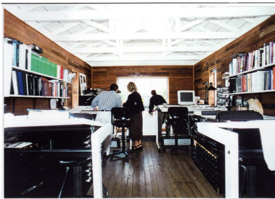
Architect's office with a staff of 7 in the Ice House.

Rex leased the land under the building from the Couderc family, but they even-