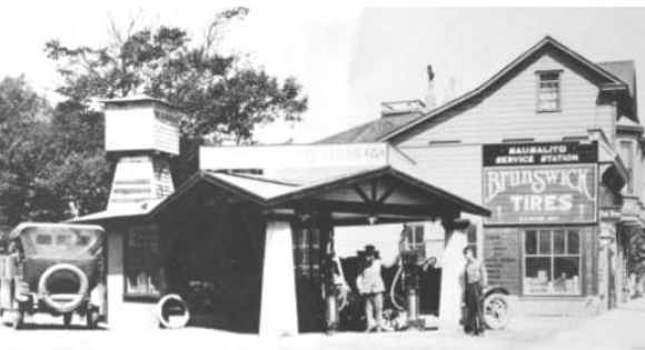
This 1920s gas station stood at Johnson and Caledonia, now the site of Sausalito Optometry.

The following day, between 11:00AM and 1:00PM, members of the Historical Society will be stationed along the entire length of Caledonia Street and available to answer questions about the street's history. Printed walking guides will be available in the SHS exhibit room (with parking at City Hall) and from docents on Caledonia Street identified by distinctive sashes. The new Caledonia Street exhibit will also be open during that period. Come walk the street, stop in at the stores and restaurants, visit the Society, and learn more about the history of this important part of Sausalito.